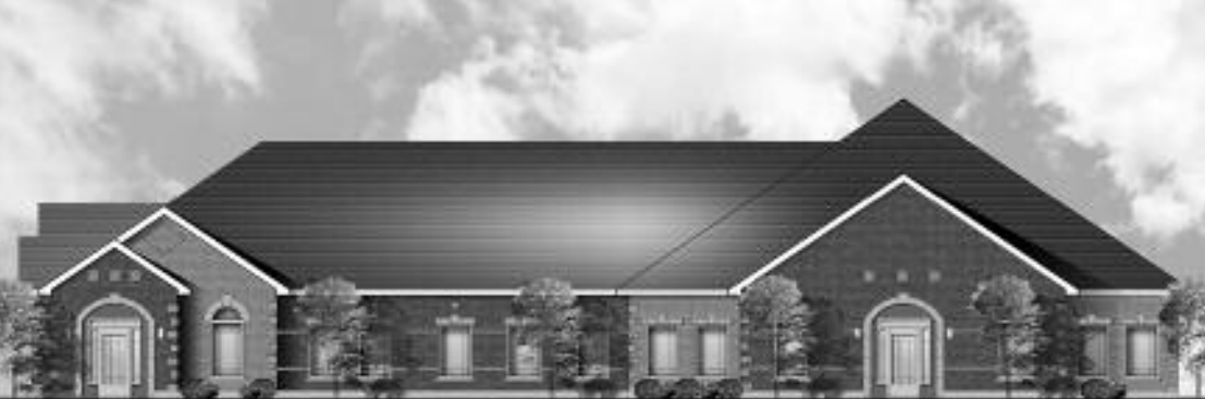
An architect's rendering of our planned 11,250-square foot service center on Indianapolis' north side